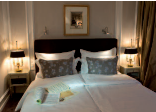
Double Room Superior