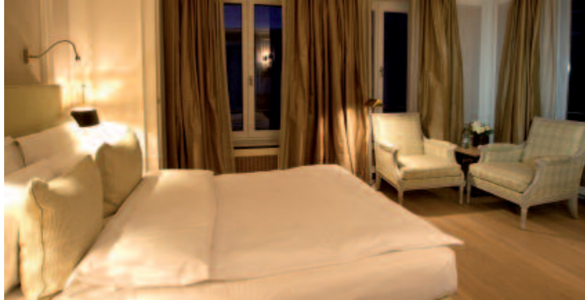
Double Room Deluxe

The Bar, Restaurant and Garden are all places to meet and relax – in short: cosmopolitan venues.