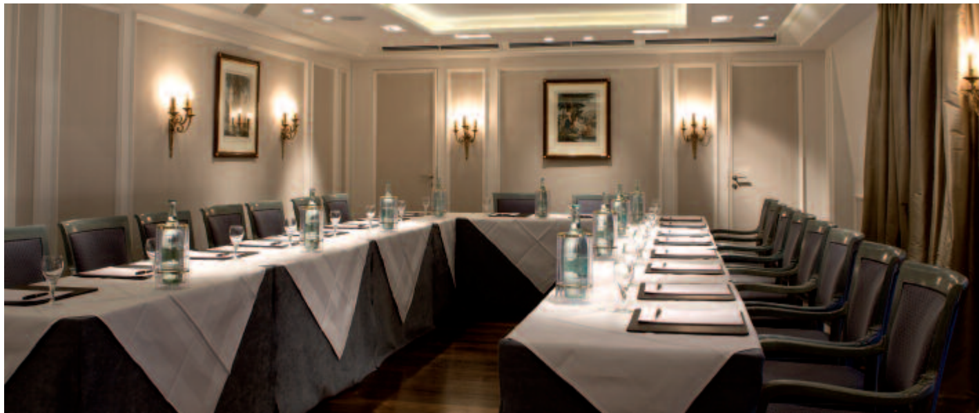
Conference Room Salon Merkur