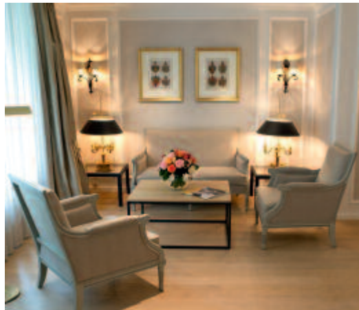
Junior Suite Living Room