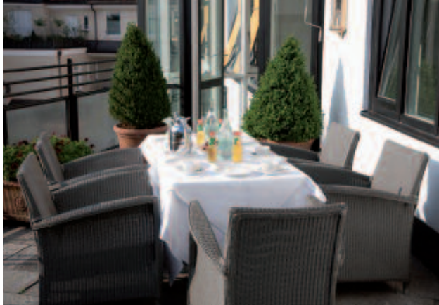
Coffee break on the roof terrace